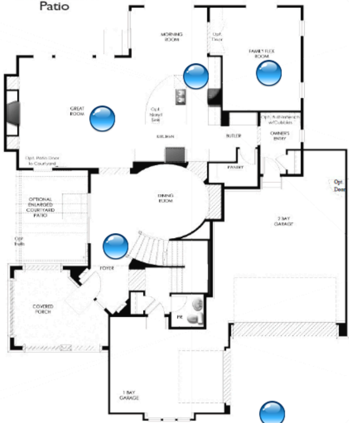
Main Level Floor Plan