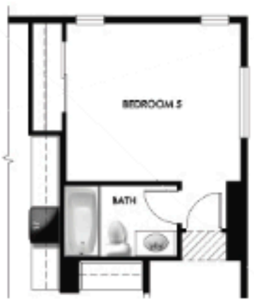
Opt. Bedroom 5 w/ Full Bath ILO Flex Room